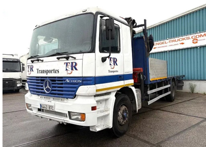
Mercedes-Benz Actros 2031 K WITH PALFINGER PK11... 4x2 Referentienummer: SN 59226484